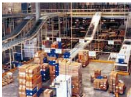
Postal and Courier Express sorting